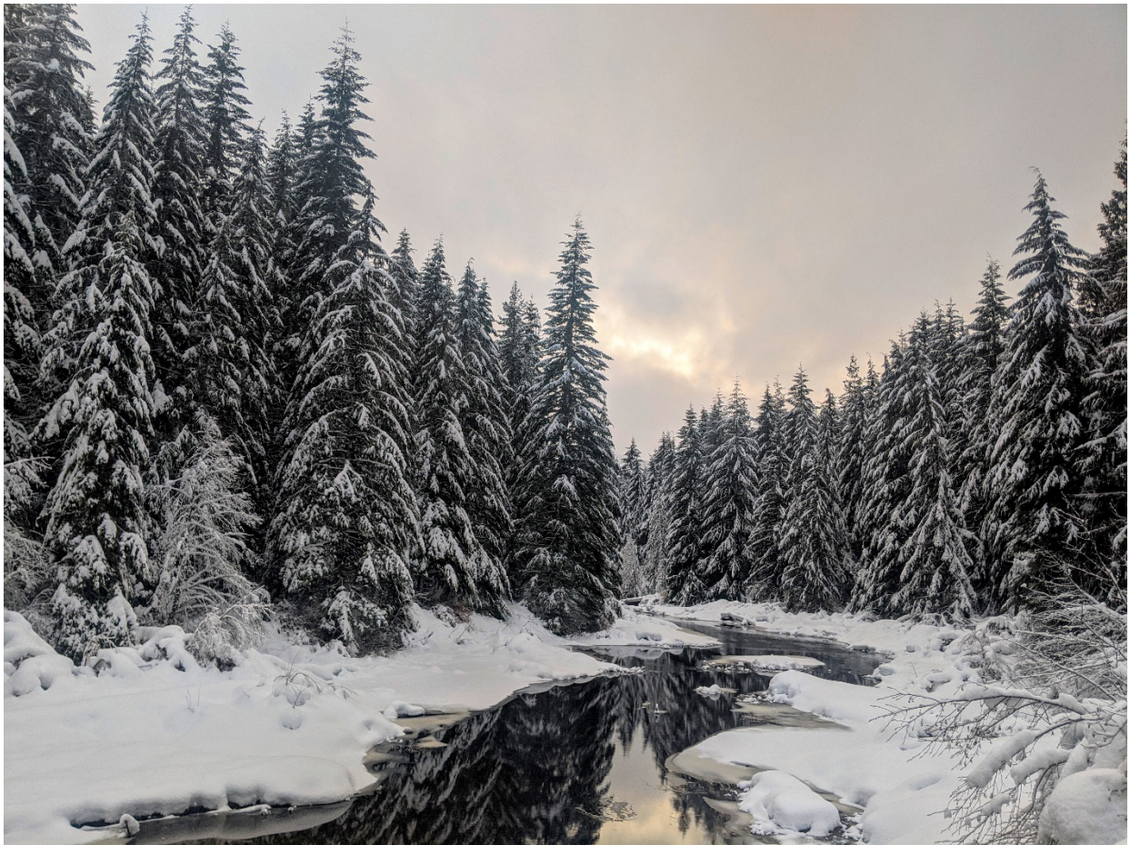
Crowman Creek – Area D