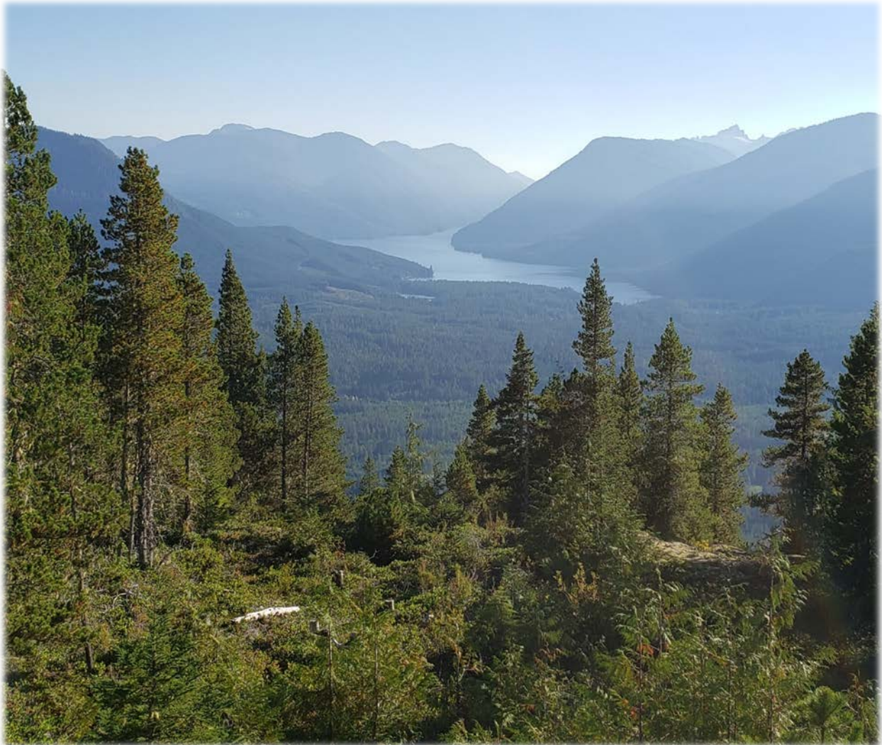
Woss Lookout – Area D