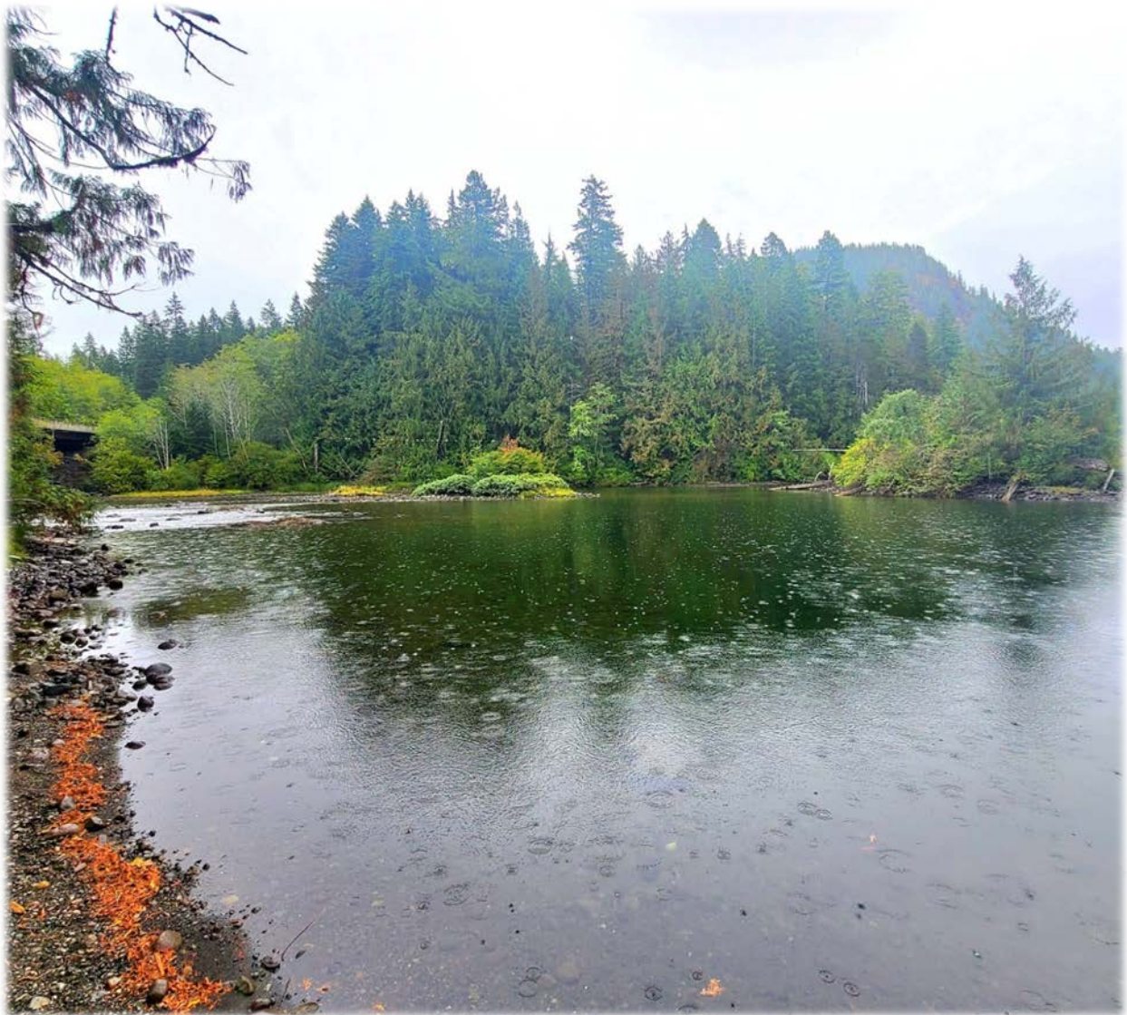
Marble River