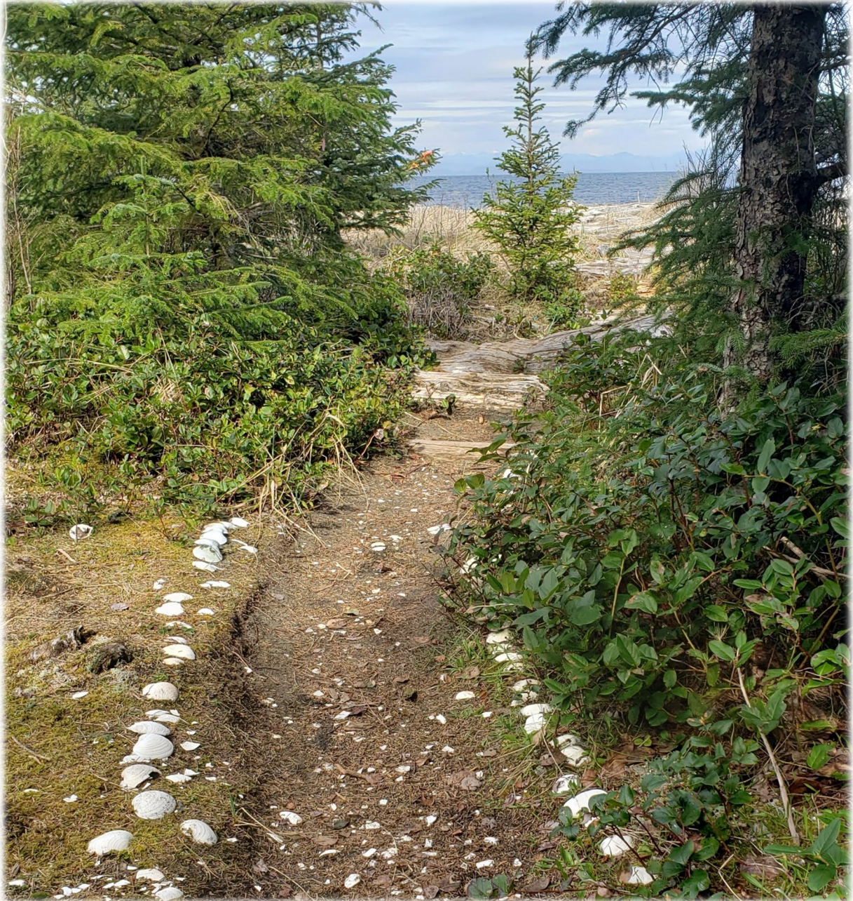
Cluxewe Marsh Trail