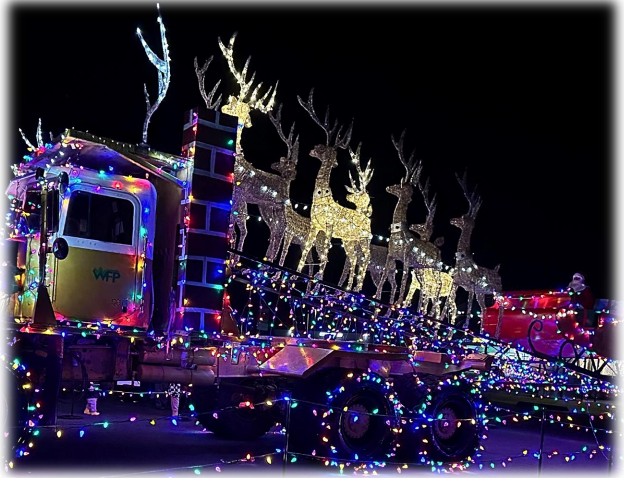
WFP Display, Port McNeill