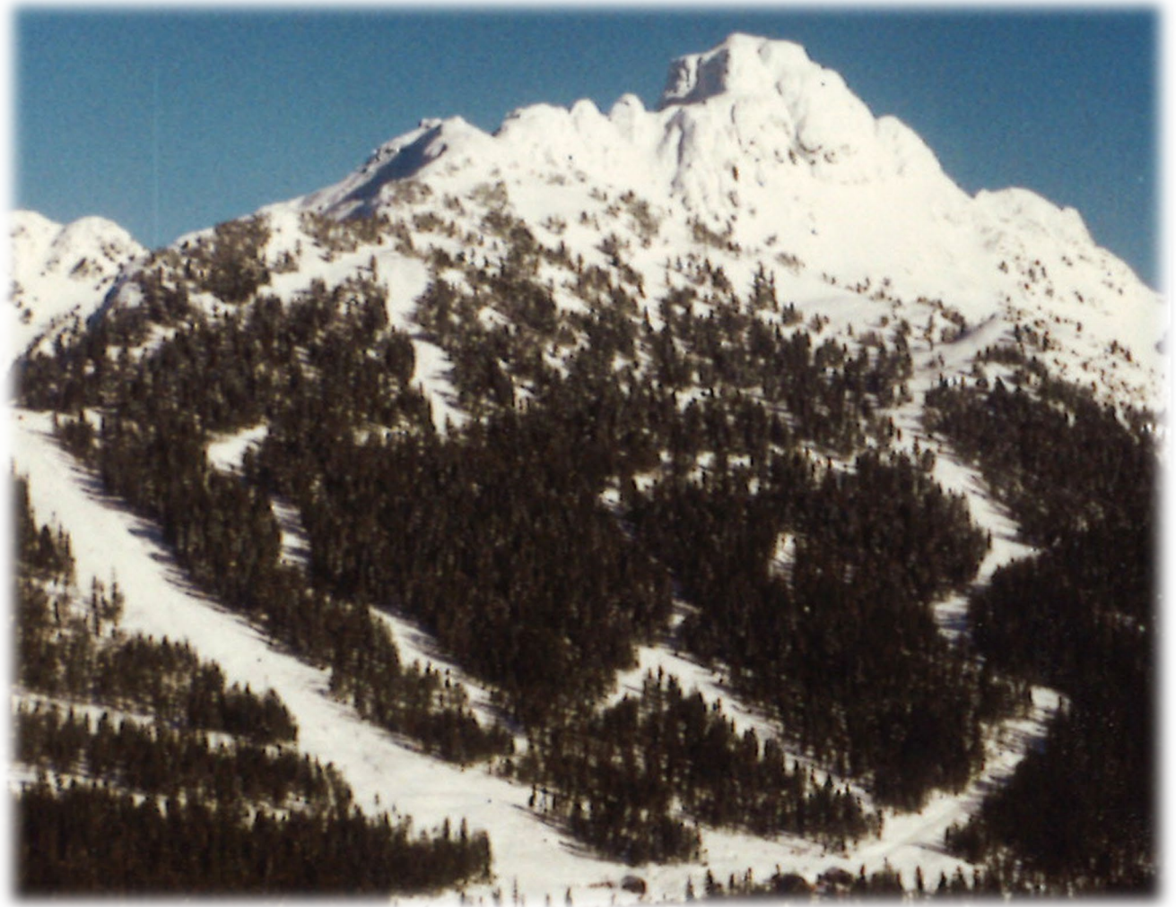
Mount Cain Alpine Park - 1989