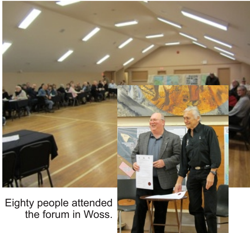
Eighty people attended the forum in Woss.

On March 24th 2012, one of the first sunny days of the year on the Mount Waddington riviera, about one third of Woss thronged to listen and exchange thoughts at a Community to Community forum between the 'Namgis First Nation and the Regional District of Mount Waddington.